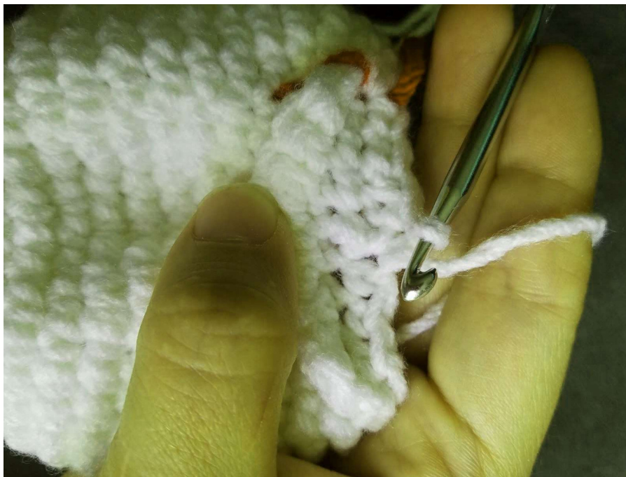
After Round 26

26) *SC 2, DEC* Repeat from * to * around (18)