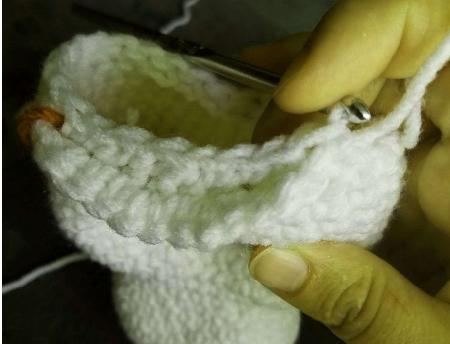
After Round 25

26) *SC 2, DEC* Repeat from * to * around (18)