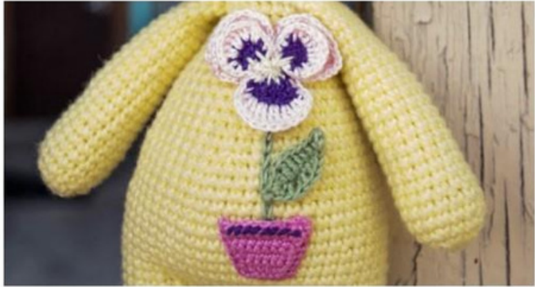
Congratulations – you're done!