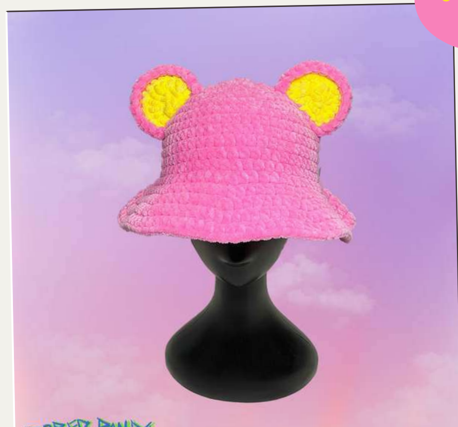
BORED PANDA HIMALAYA DOLPHIN BABY MAIN: 80332 SECONDARY: 80313