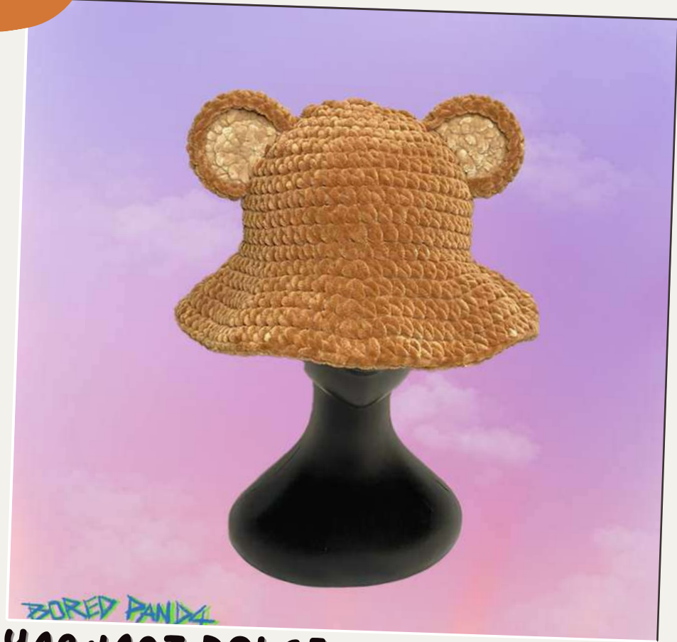
BORED PANDA YARNART DOLCE MAIN: 765 SECONDARY: 747