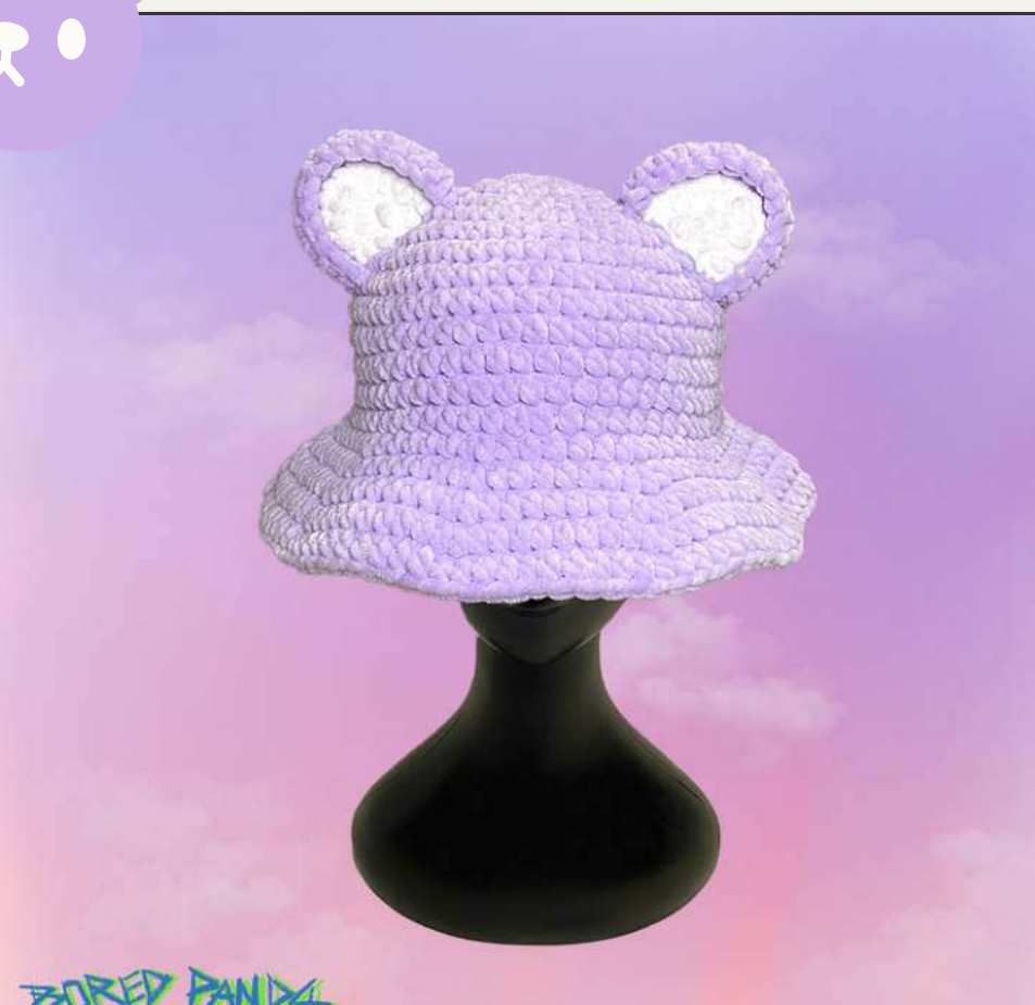
BORED PANDA YARNART DOLCE MAIN: 744 SECONDARY: 741