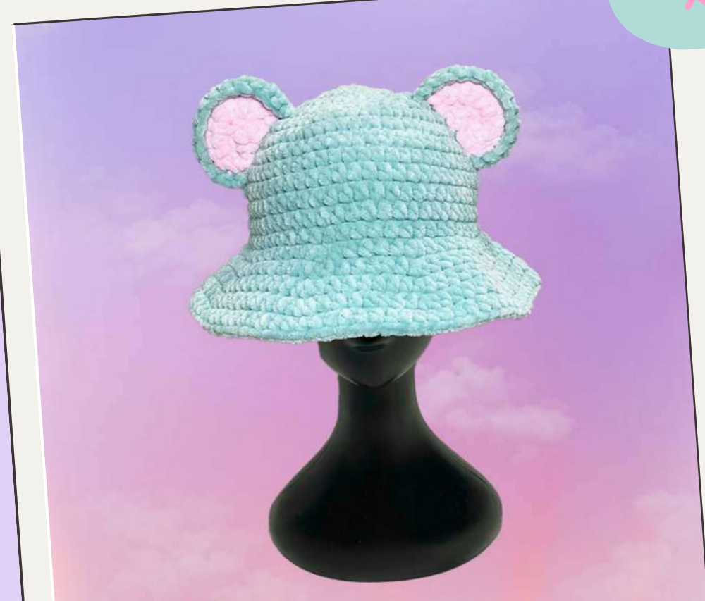
BORED PANDA HIMALAYA DOLPHIN BABY MAIN: 80347 SECONDARY: 80303