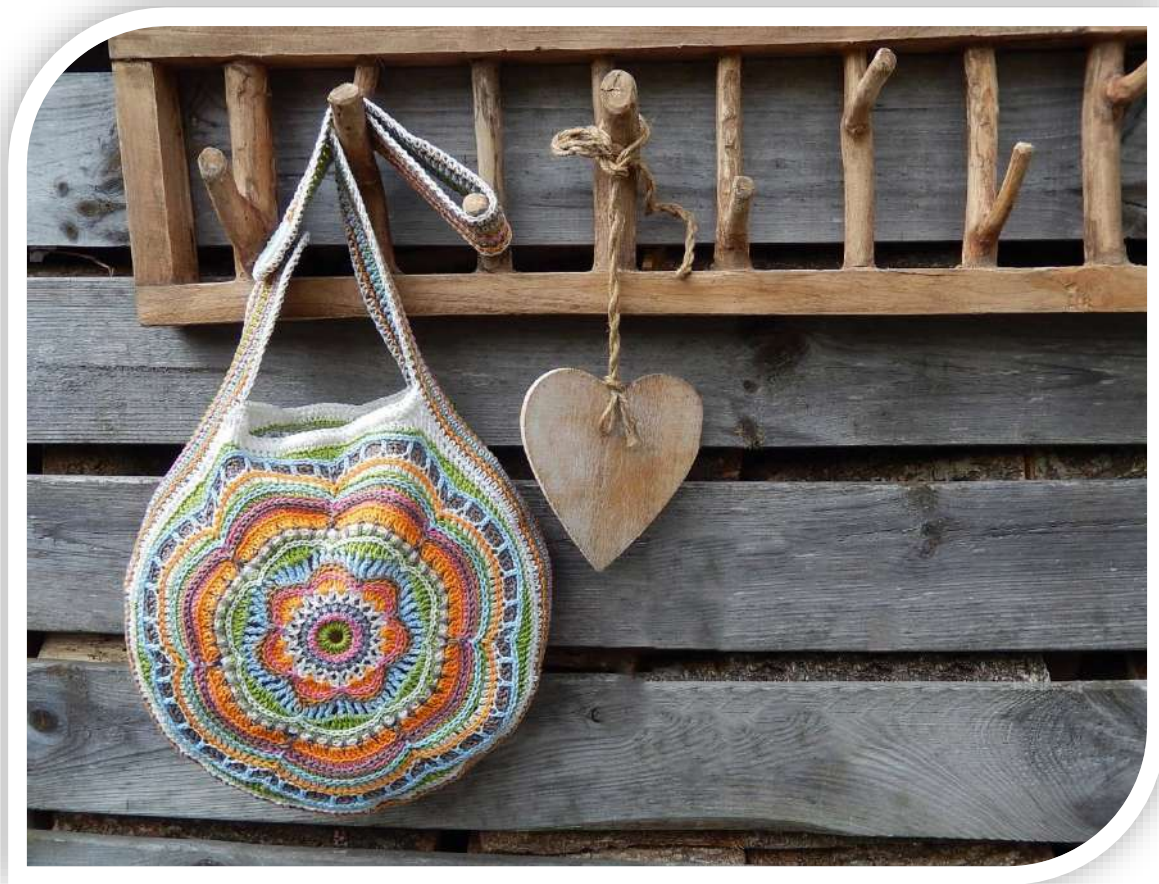
BOHO FLOWER SLOUCH BAG